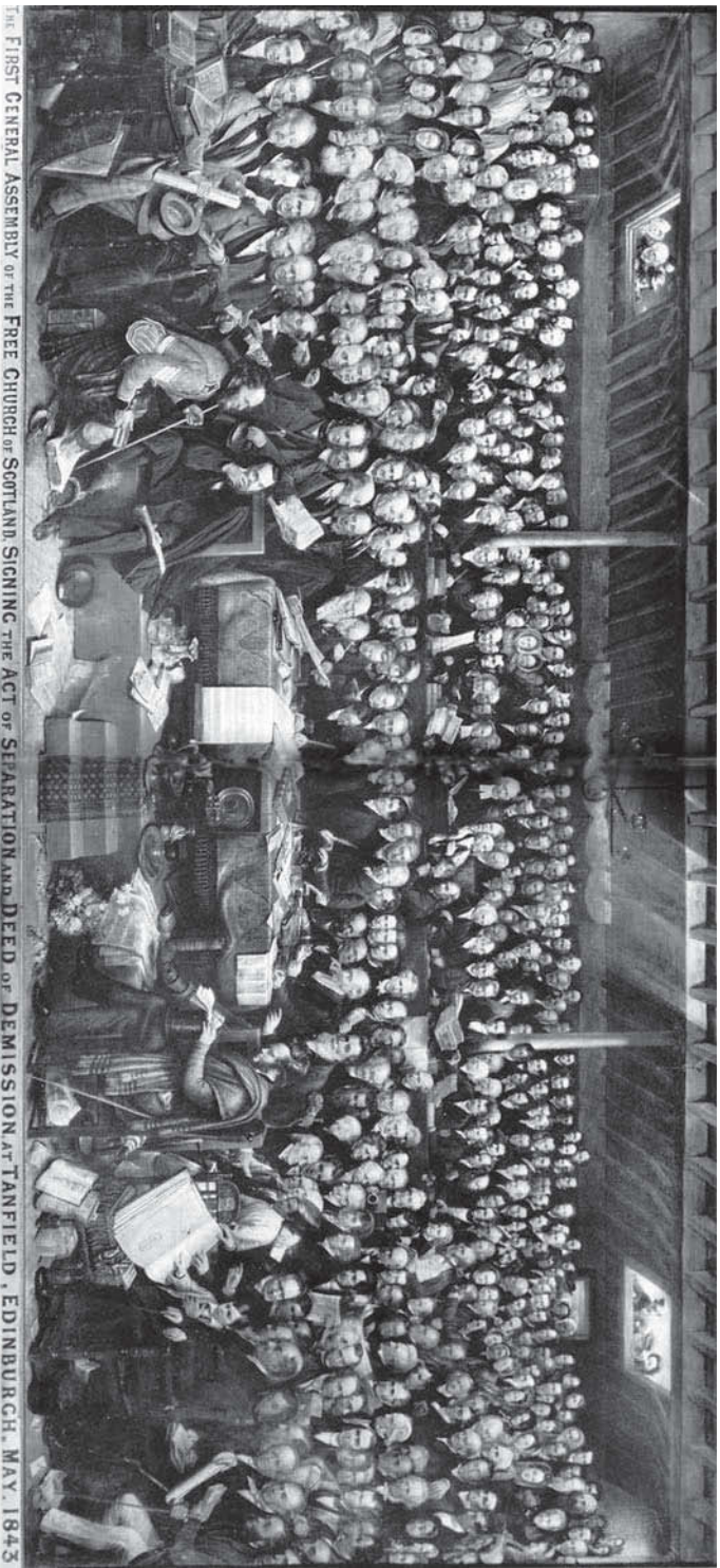
The First General Assembly of the Free Church of Scotland: Signing the Act of Separation and Deed of Demission at Tanfield May 1843 by David Octavius Hill The original painting is in the Free Church College, Edinburgh